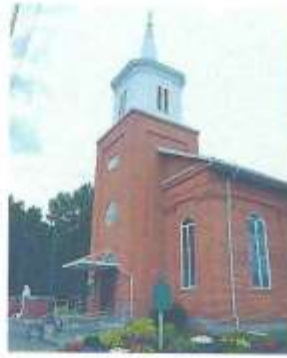
ST. JOSEPH CATHOLIC CHURCH