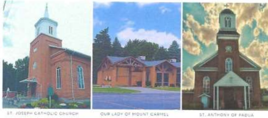
ST. JOSEPH CATHOLIC CHURCH