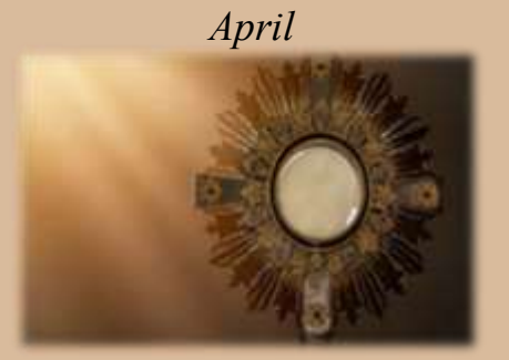
Month of the Holy Eucharist

Epistle: 1Corinthians 5:7-8 Gospel: Mark 16:1-7