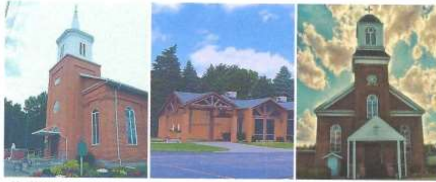
ST. JOSEPH CATHOLIC CHURCH