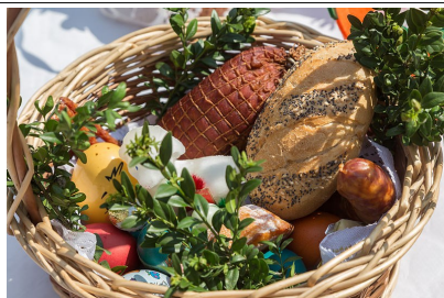
The Blessing of Easter Food Baskets will take place on Holy Saturday, April 19, at Noon.