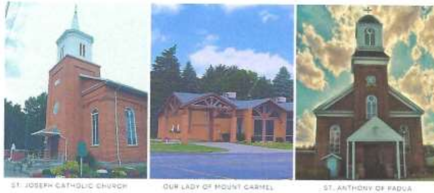
ST. JOSEPH CATHOLIC CHURCH