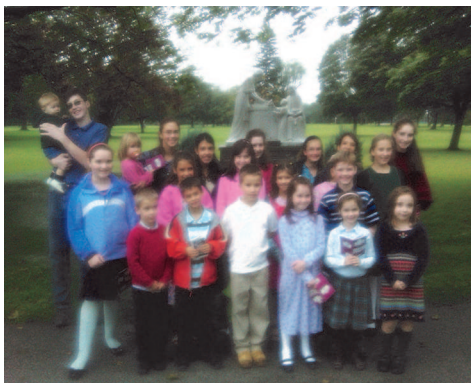
The Holy Family Society